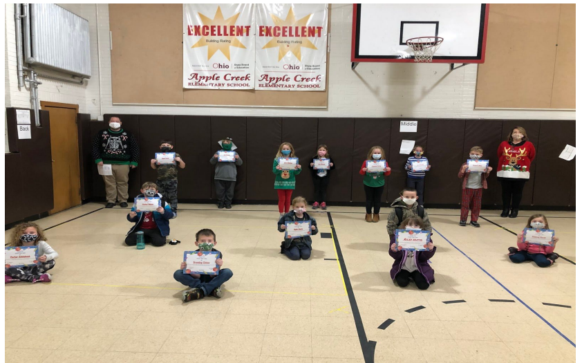
LIM Habit #4: Think Win-Win