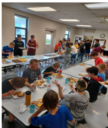
Football team meal