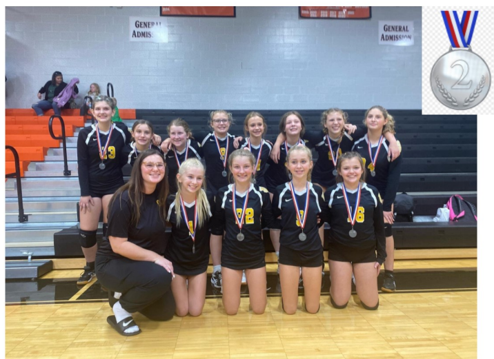
Congratulations 7th grade volleyball!