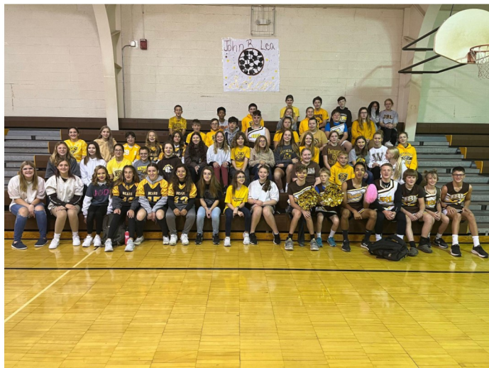
BROWN & GOLD Day