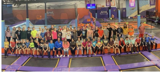
Altitude Trampoline Park fundraiser reward!

Nov. 4- Veterans Day Nov. 7-AU Field Trip-8th Gr. Nov. 9-AU Field Trip-8th Gr. Nov. 12-Butter Braid Pick-up Nov. 18-20-Fall Play Nov. 24-28-No School Dec. 19-Winter Concert Dec. 21-Jan. 3-Christmas Break Jan. 16- No School